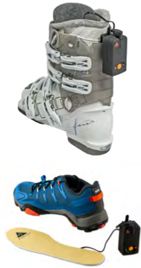
(Shoes not included in the set)