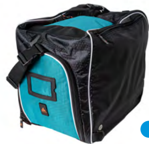
● black/ blue